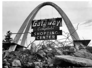
Historic photos of the Gateway Fred Meyer and the Iconic Gateway Arch