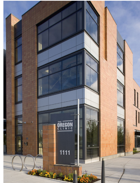
The Oregon Clinic