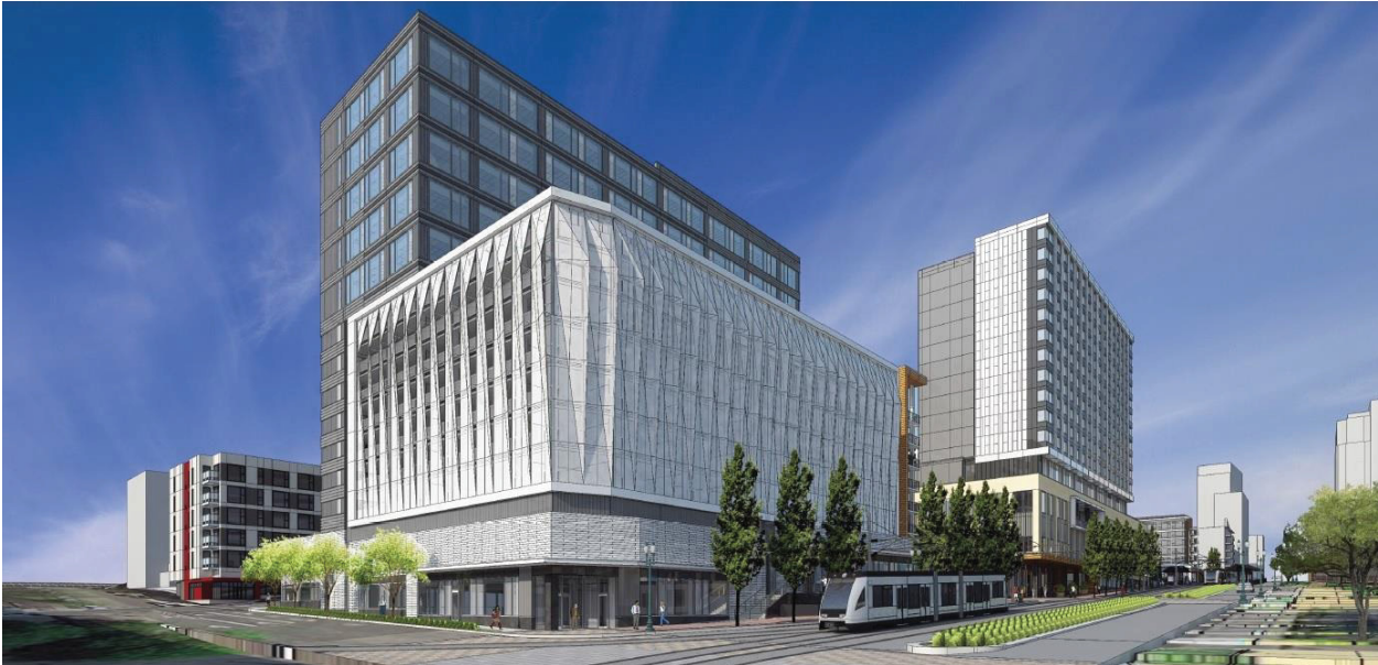
View looking Southwest from corner of NE 2 nd Avenue and